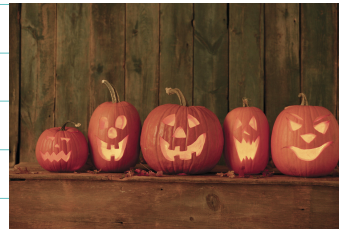
Five little pumpkins sitting by the gate. (ask your child to sing you the song)

Glenwood's annual family pumpkin decorating contest will be held on October 30th. Prizes will be awarded for the silliest, scariest and most creative pumpkins. Each family is encouraged to bring in one pumpkin. Please drop off your pumpkin with a sign bearing your family's name to the library by 9:00 on Friday morning. Pumpkins picked up at the end of the day.