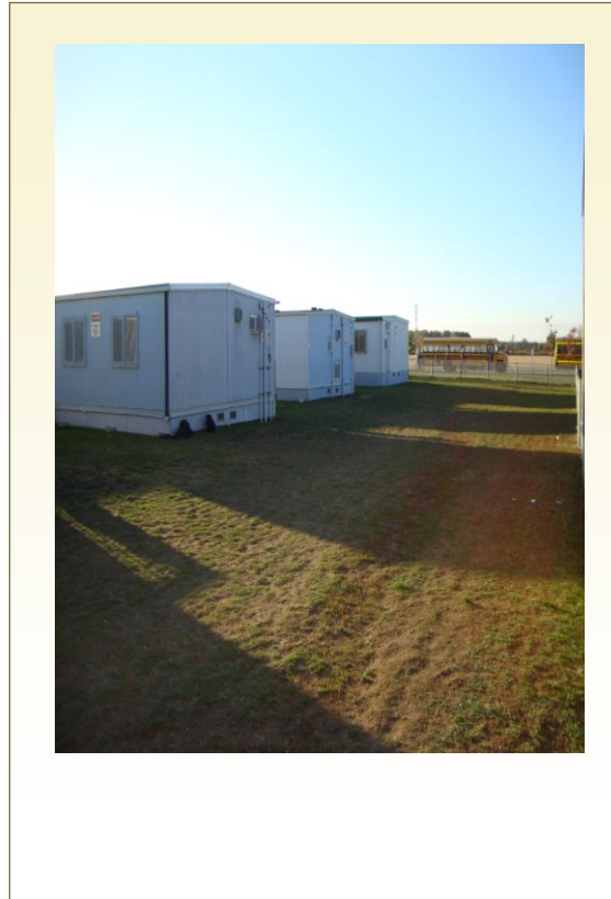
The current state of our proposed greening area.